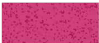
238-ME 1/4 yd