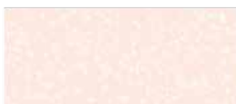
238-ML1 2/3 yd