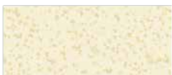
238-ML 1/4 yd