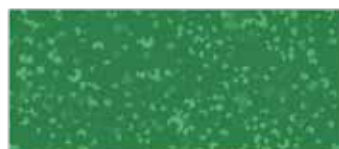
238-MG1 1/4 yd