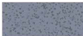
238-MC 1/4 yd