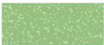
238-MV 1/4 yd