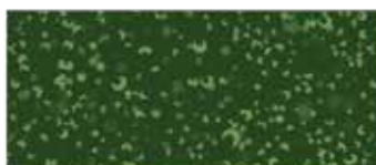
238-MG 1/4 yd