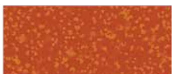
238-MO 1/4 yd