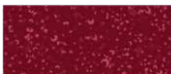
238-MR1 1/4 yd