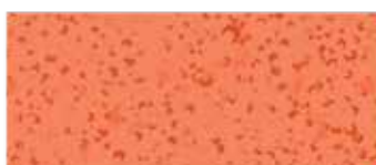
238-MO1 1/4 yd