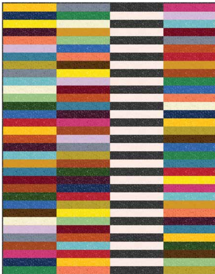
Buster Quilt designed by: Eye Candy Quilts • Quilt Size: 54" x 66"