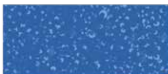
238-MB1 1/4 yd