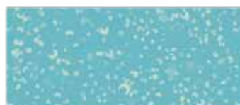
238-MT 1/4 yd