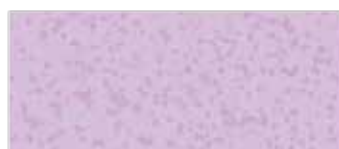
238-MLP 3 3/4 yds (includes backing)