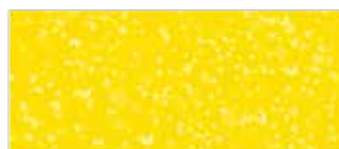
238-MY1 1/4 yd