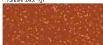
238-MO2 1/4 yd