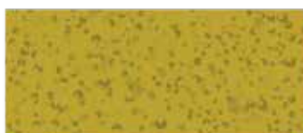
238-MY 1/4 yd