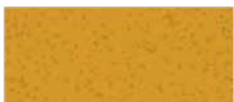
238-MY3 1/4 yd