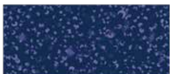
238-MB 1/4 yd