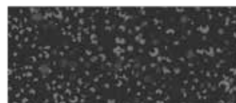
238-MK 1 1/4 yds (includes binding)