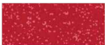
238-MR 1/4 yd