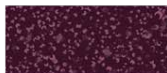
238-MP 1/4 yd