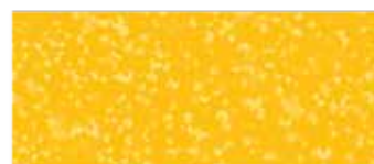
238-MY2 1/4 yd