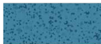
238-MT1 1/4 yd